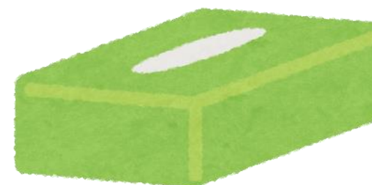
tissue boxes, etc.