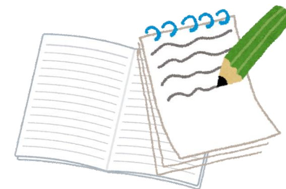
notebooks, memo pads