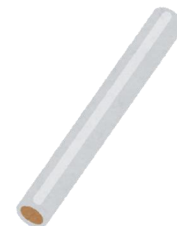
paper tubes from toilet paper, plastic wrap etc.